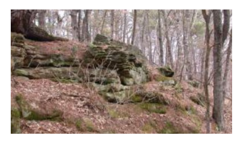
Sandstone outcrop in Interstate Park on the Wisconsin side, near Eagle Peak.

A while ago I was doing geologic mapping on the Wisconsin side of Interstate Park, near St. Croix Falls, Wisconsin. Although my study focused on basaltic lava flows, I often found outcrops of Cambrian sandstone, conglomerate and shale that had been deposited on the basalt. They formed as the Cambrian sea came in and slowly submerged outcrops of eroded basalts, making them into islands. On one of the sandstone outcrops I found an odd crust made of tiny blue-green crystals.