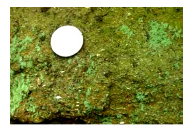
Sandstone with many white phosphatic brachiopod shell fragments mixed with quartz sand. The coin for scale is a U.S. quarter.

The apatite group of minerals is the most common group of phosphate-bearing minerals. The little shellfish had discovered the neat trick of extracting the phosphorous dissolved in sea water to build their shells. These shells are less likely to dissolve than those made of calcium carbonate, so can survive long periods of burial in the earth.