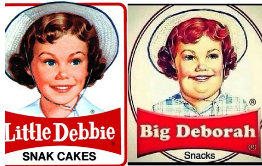
Then Before Safer at Home Now During Safer at Home