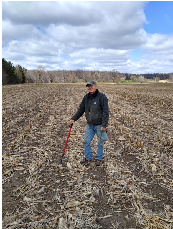
Social distancing at its finest.

A10: She will granite. (You knew there would be a least one granite joke...right?)