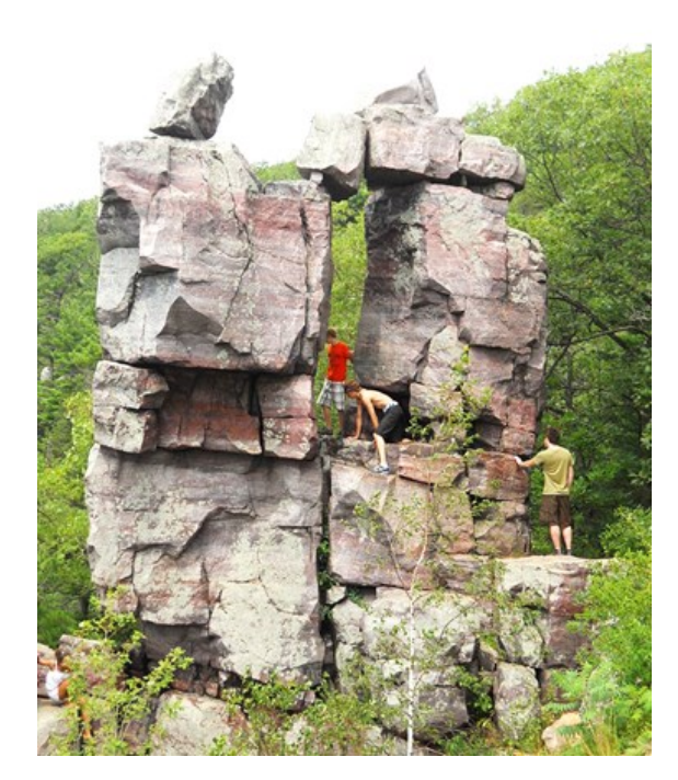
The Devil's Doorway in Devil's Lake State Park, Wisconsin.

Highlighted in the bird's-eye-view aerial trip was the opportunity to compare a relatively small part of Wisconsin's unglaciated terrain, the Driftless Area, to the features of the glaciated area left by the Green Bay Lobe of the Laurentide Ice Sheet: the Wisconsin Dells, the Drumlins, the Kettle Moraine Country between the Green Bay and Lake Michigan Lobes, and the Devil's Lake region known as "a geologist's paradise."