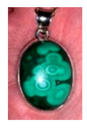
Photo of a malachite pendant by Nick Smith, from the June 2020 Strata Data of the Three Rivers Gem & Mineral Society (Indiana).

Malachite often forms from stalactites when copper-rich water drips down. More water present results in a lighter color, as seen in my pendant. It