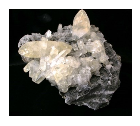
Specimen's upper section by daylight.

The upper section of this specimen consists of several truncated rhombohedron calcite crystals ranging from 3 inches to 3/16 of an inch on edge. These crystals are yellowish-brown in daylight, translucent and situated atop of a dark-gray limestone matrix. Additionally, small, unidentified gray druzy crystals are also present.