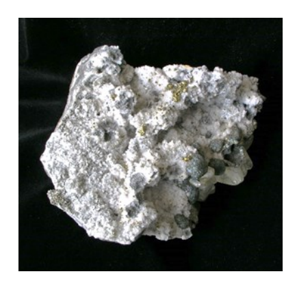
Specimen's lower section by daylight.

In contrast, the lower section of this specimen consists of minute, white, steep scalenohedral calcite crystals that are about 2/16 of an inch on edge. These crystals are associated with poorly formed galena crystals and partially formed chalcopyrite crystals.