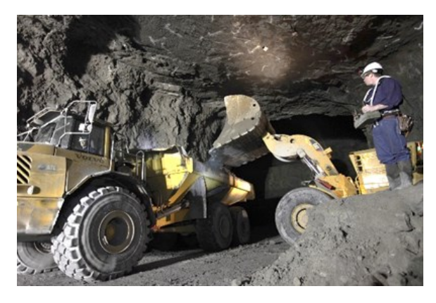
An employee of The Doe Run Company, which owns Sweetwater Mine, operates a front-end loader by remote control.

The calcite specimen is part of my study collection of minerals that exhibit fluorescence and phosphorescence. This collection mainly focuses on fluorescent minerals such as aragonite, calcite, strontianite, barite, fluorite and sphalerite that originate from various localities.